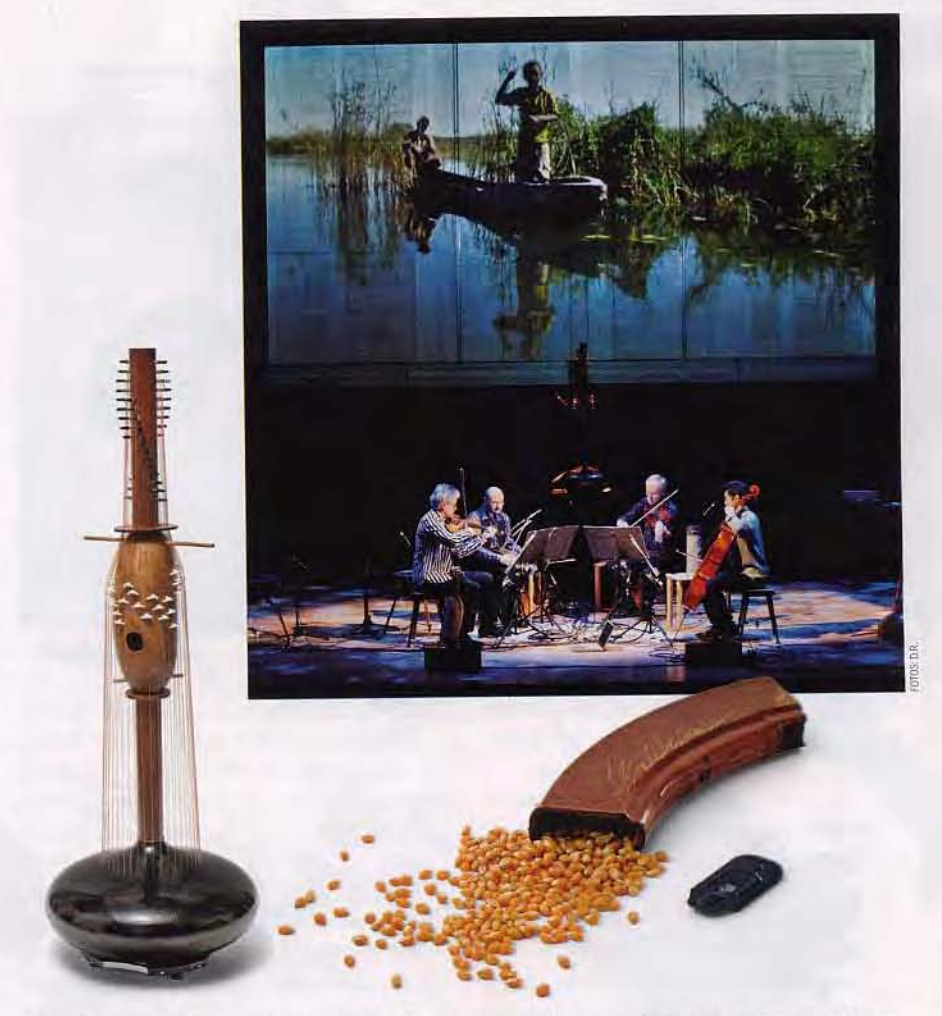
'Rio Cunene' Um espetáculo em que o Kronos Quartet ( em cima ), instrumentos inventados por Victor Gama ( à esq. ) e outros por crianças angolanas ( à dir. ) são protagonistas

O espetáculo Rio Cunene é, na realidade, uma «montagem de várias peças», que integra, para além da composição homónima interpretada pelo Kronos Quartet, uma apresentação a solo de Victor Gama: SOL(t)O. Mas se, em Rio Cunene, o fio condutor é o rio, no caso de SOL(t)O é «uma estrada», marcada pela pluralidade e transversalidade dos elementos que a compõem. SOL(t)O é um espetáculo multimédia que reúne um conjunto de composições para Pangeia Instrumentos, desenhados e construídos por Victor Gama, como um «reflexo das significâncias, dos símbolos e dos conteúdos da narrativa que estrutura uma peça». Por outras palavras, estes